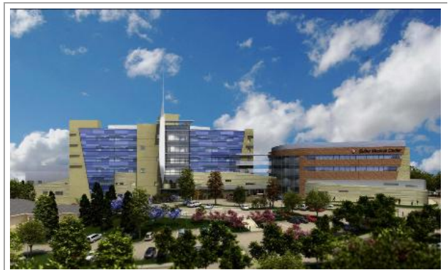
Sutter Health's new acute care hospital and medical office building, Castro Valley, Calif.

The MOB will be connected on all four floors to the $320 million, 130-bed, 230,000 square foot acute care Eden Medical Center, which is now under construction.